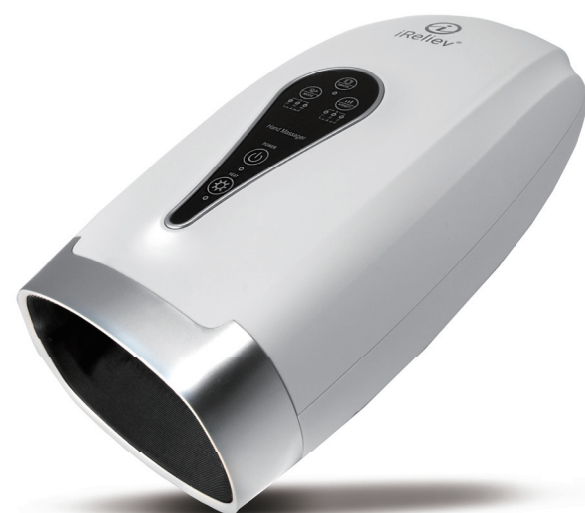
Model # MA-7000-WH

Thank you for purchasing the iReliev® Hand & Wrist Massager. Please read this user manual carefully and keep it in a safe place for future reference.